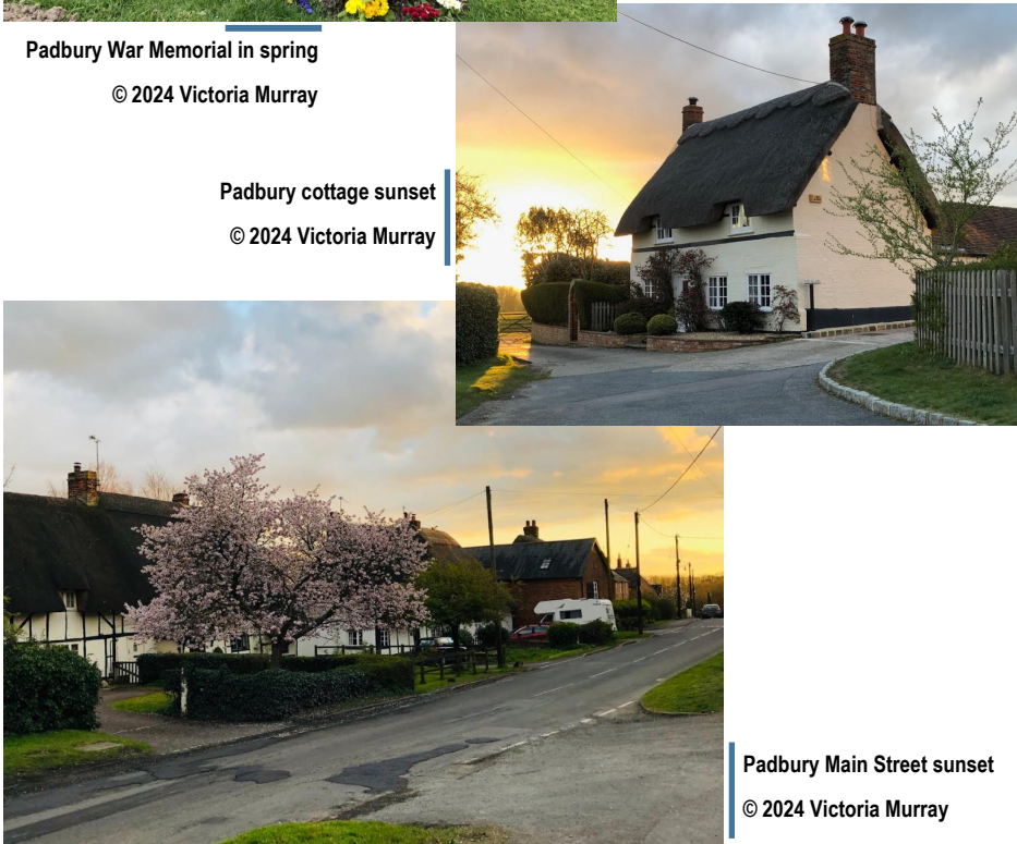
Padbury Main Street sunset