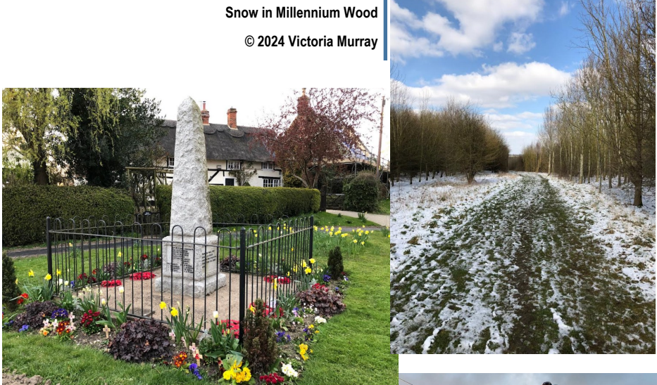
Padbury War Memorial in spring